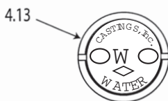
4.13 Cast iron water lid with two hole erie pattern and brass insert threads

Cast iron water lid standard Cast iron arch pattern design Upper section 1" steel pipe Telescoping length of 12" For use with regular pattern inverted plug corp stops 1 1/4", 1 1/2" and 2" For use with regular pattern ball valves 1 1/2" and 2"